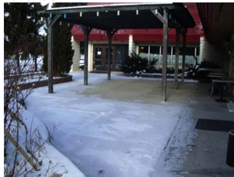
Doorway to meeting room

Contributions to the scholarship fund are encouraged. For the hard of hearing, the flea power transmitter on 146.625 will be provided, so bring your handheld.