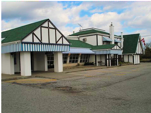
Our old home, The Plainsman served us well

Our spring meeting will be held on Saturday, 3 May, 2008 at The Mohawk Inn located at the northwest corner of Campbellville Road and Highway 401. As usual coffee will be available at 9 AM. Many of you will remember meeting there 10 or more years ago. The Plainsman Restaurant is now closed and the property is probably sold by now. The days of $15 lunches are over.