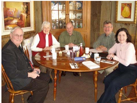
Our Staff Investigators at The Mohawk

Some members of your executive investigated various locations for the meeting and settled on The Mohawk Inn as the best choice.